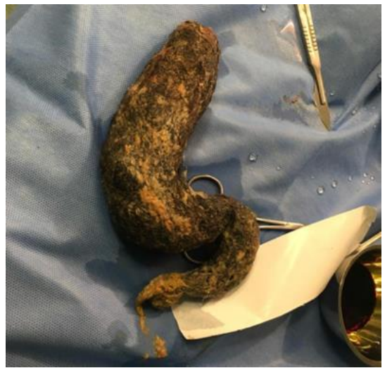
Figure 5: Gastroduodenal trichobezoar surgical specimen

Significant gastric distension with a heterogeneous hypodense lesion formation, with regular contours appearing to be totally independent of the gastric wall, containing air bubbles and calcifications consisting of a multitude of concentric circles of different densities distributed like onion bulbs.