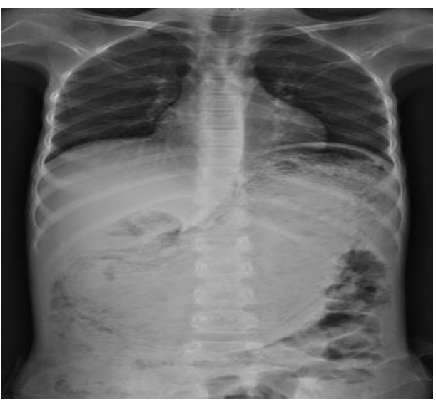
Figure 2: Unprepared Abdomen (UAP)

Hyperechoic arciform structure followed by a frank posterior shadow cone cone in the epigastric region.