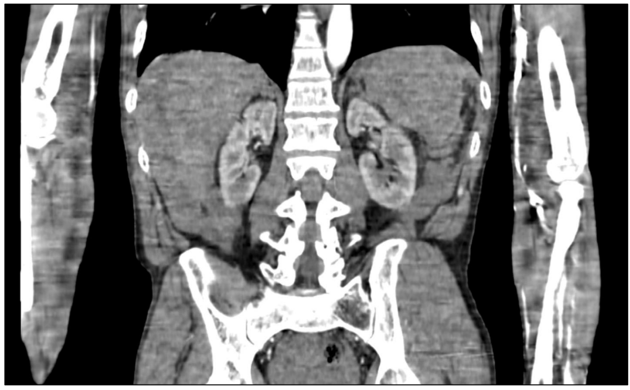
Fig 2: Coronal section of the abdominal CT scan showing the splenic rupture with the deformities and the hemoperitoneum