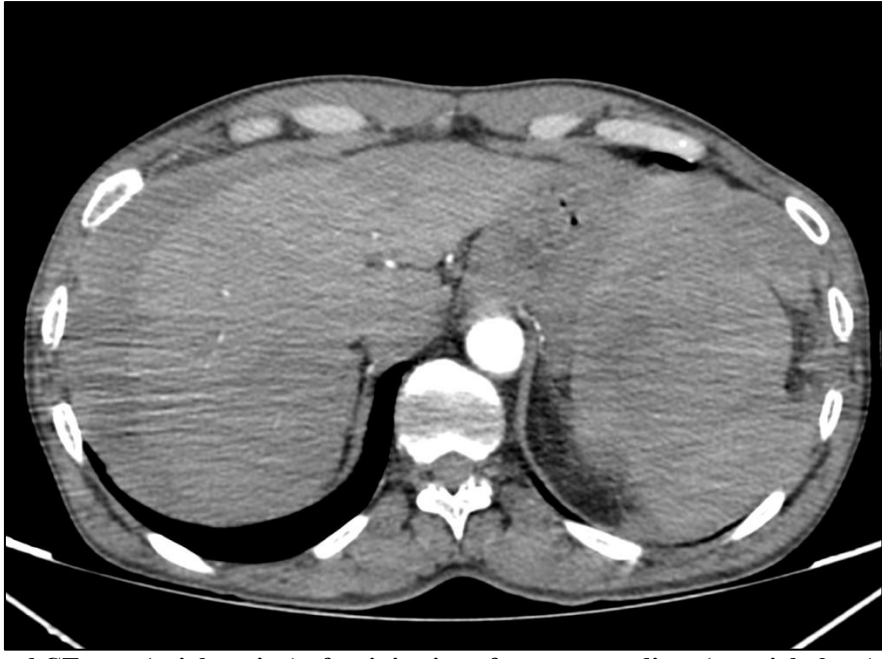
Fig 1: Abdominal CT scan (axial section) after injection of contrast medium (arterial phase): a heterodense formation has been observed in the upper pole of the spleen with hemoperitoneum