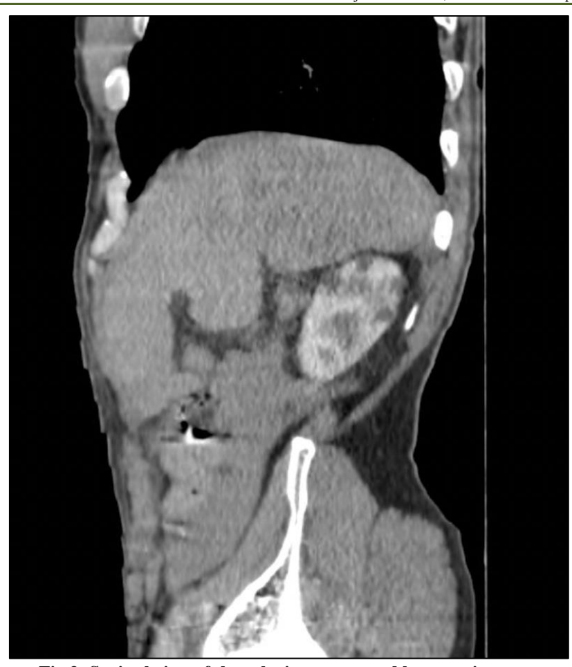
Fig 3: Sagittal view of the splenic rupture and hemoperitoneum