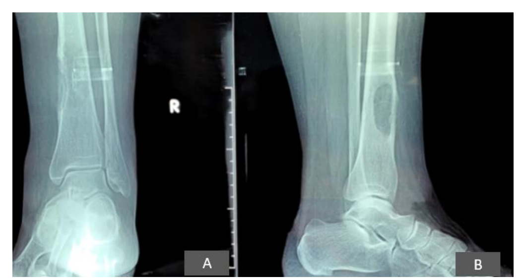
Figure 1: An AP (A) and lateral (B) view of the left ankle: an unifocal osteolytic, eccentric and expansive lesion, affecting the anterior cortex and marrow of the distal third diaphysis of the left tibia, associated to a cortical disruption and without a peripheral osteosclerosis or periosteal reaction

A 55-year-old woman with no particular pathological history who presented with leg pain evolving for 4 days. Standard X-ray showed an unifocal osteolytic, eccentric and expansive lesion, affecting the cortex and marrow of the distal third of the diaphysis of the left tibia with cortical disruption. We note that the lesion is not associated with peripheral osteosclerosis or periosteal reaction.