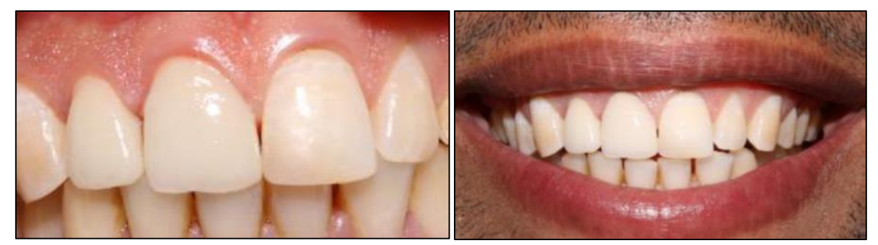
Fig. 8: final result: aesthetic and functional integration of all ceramic crowns, patient was satisfied by the result