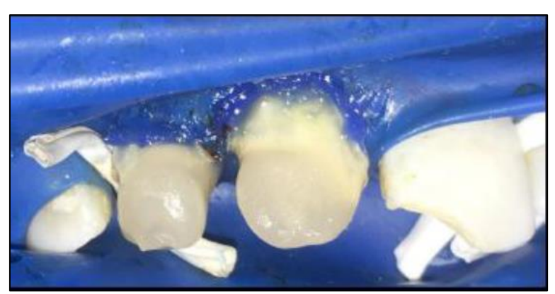
Fig. 5: cores build up on #12 and #11 teeth

build up were done with composite (Composite Empress Direct - Ivoclar Vivadent).