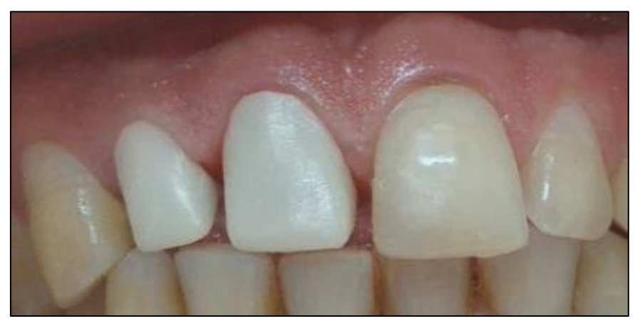
Fig. 7: trying in of frameworks

The patient was satisfied with the shape and shade of the ceramic restorations.