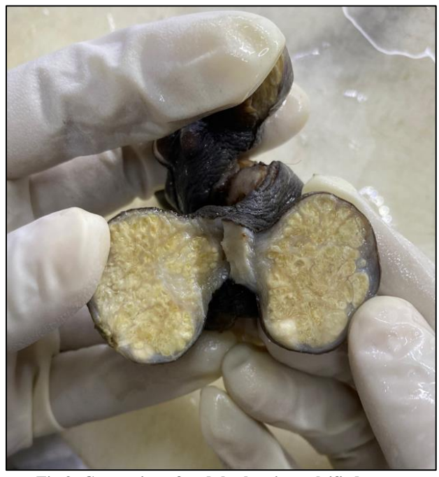
Fig 3: Cut section of nodule showing calcified areas