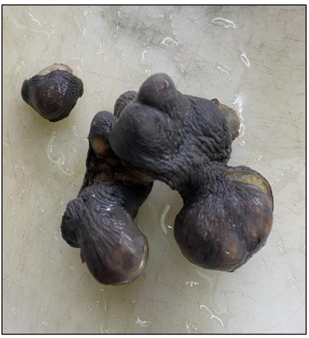
Fig 2: Gross specimen of scrotal skin containing multiple nodules

On microscopy, amorphous, deeply basophilic, extracellular, dermal calcium deposits were seen. A foreign body-type inflammatory infiltrate consisting of multi-nucleated giant cells with an associated mixed inflammatory infiltrate surrounds the calcium deposits.