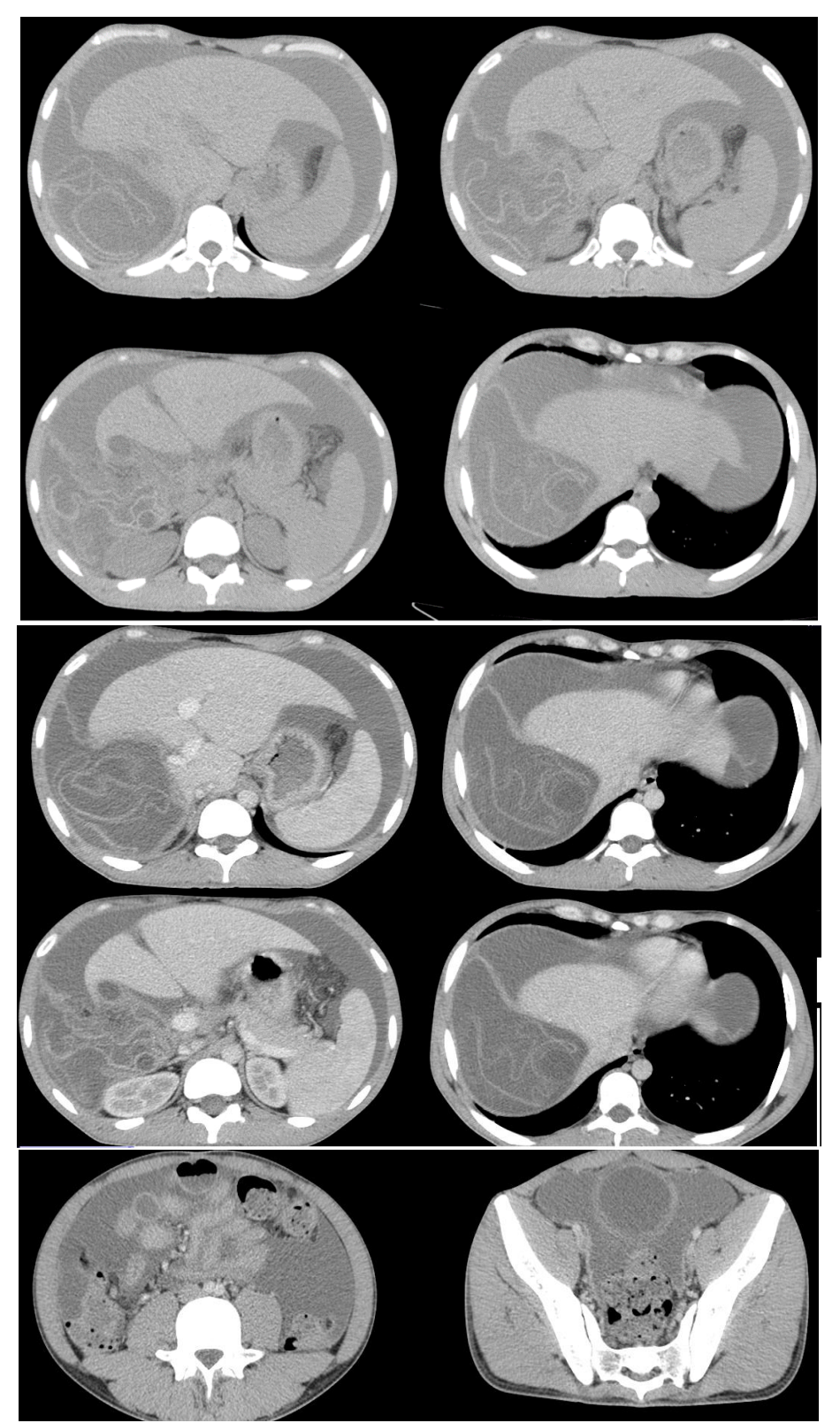
Fig. 3: An abdominal computed tomography scan demonstrated multiples serpiginus structures in the right lobe of the liver with fluid effusion and some cystic structures in the pelvic cavity suggesting the Rupture of a hepatic hydatic Cyst

and significant free fluid in the perihepatic and perisplenic areas and pelvis, with scalloped thin wall, containing multiple floating membranes and two vesicular lesions (Fig. 3).