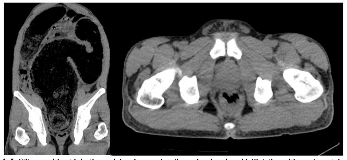
Figure 4 -5: CT scan without injection, axial and coronal sections, showing sigmoid dilatation with empty rectal ampulla without parietal thickening antero-posterior diameter.