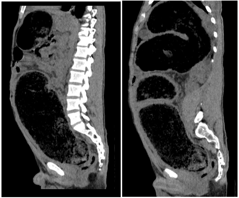
Figure 3: CT scan without injection, coronal section a dilatation of the colonic framework with absence of individualization of the colonic haustrations, without detectable zone of disparity of the caliber