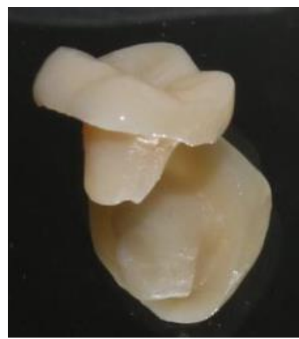
Fig. 9: Endocrown frabicated from IPS emax Cad