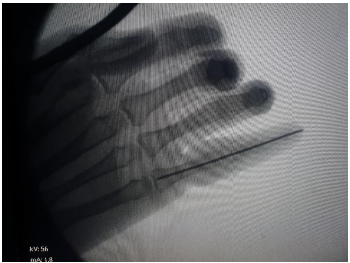
Figure 8: Arthrorisis of the IPP and the IPD of the 5th finger