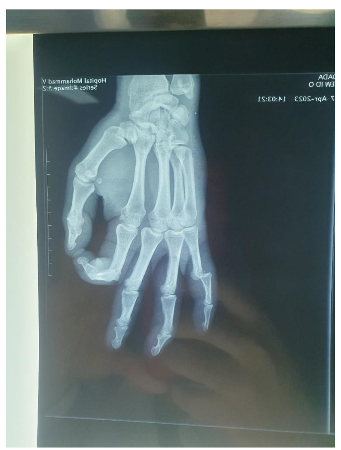
Figure 4: X-Ray of the posterior dislocation of the IPP