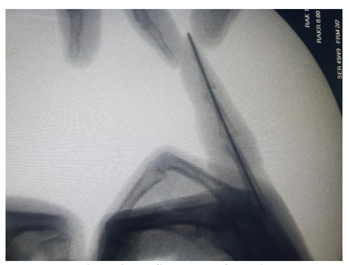
Figure 9: Profile X-Ray of the pin