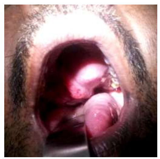
Fig. 1: Nodular mass over hard palate extending mediolaterally from the mid-palatal area to the molar teeth

A 35 year male reported with a slowly growing mass on soft palate which was present for the past 6 years and gradually progressing in sits size. On examining intraorally, a nodular mass was present in relation to the left side of the palate measuring roughly about 5 \times 4.5 cm extending mediolaterally from the mid - palatal area to the lingual surface of molar teeth (Figure 1). The mucosa over the swelling appeared to be normal with no secondary changes. On palpation the mass was non - tender, firm in consistency, noncompressible, did not show any fluctuation or pus discharge. A clinical differential diagnosis of dentigerous cyst with nodulous outset (due to its proximity to molar teeth) and a tumour of minor salivary gland origin (benign or malignant) were considered. Fine needle aspiration was performed, which yielded mucoid scanty material. Smears were stained with hematoxylin and eosin stain, showed moderate cellularity comprised of poorly cohesive epithelial like cells having bland ovoid nucleus in a background of fibromyxoid stroma (Figure 2). Diagnosis of pleomorphic adenoma of minor salivary gland was rendered. Histopathological examination of the specimen showed confirmed the FNAC diagnosis. Histopathological sections showed epithelial component arranged in cords tubules, nests and sheets, focally displaying squamous metaplastic changes, intermingled mesenchymal myxoid component pseudocartilaginous stroma (Figure 3).