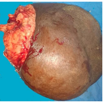
Figure 3: 12 Kg operating piece