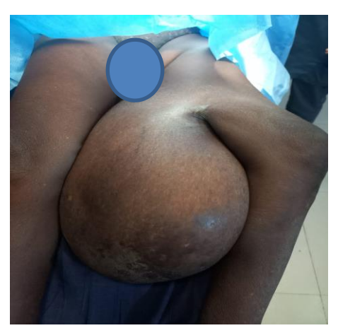
Figure1: Giant lipoma of the left thigh

We carried out a total resection of the tumor and the excess skin was resected allowing aesthetic closure on a Redon drain (suction). The weight of the operative part was 12 kilograms. The operative followup was simple. The anatomo-pathological examination of the surgical specimen concluded to a fibrolipoma of the thigh. The post-operative follow-up at one month, three months and 6 months was simple.