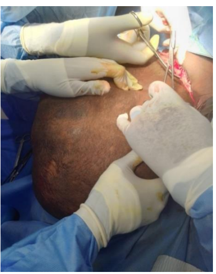
Figure 2: Arcuate incision