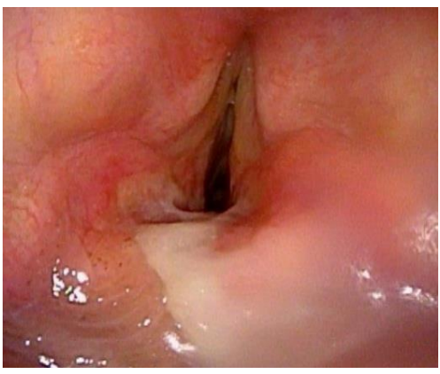
Figure 3: The rigid laryngoscopy finding performed in the otolaryngology department after surgery shows ulcerative mucosa of supraglottis and asymmetric vocal fold

Postoperatively, the otolaryngology department was consulted after the patient had recovered from general anesthesia. Laryngoscopy findings (Fig. 3), it was highly suspected that the patient had laryngeal tuberculosis. The patient did not have any symptoms of sore throat or discomfort. Movement of the left vocal cord was normal, and while movement of the right vocal cord was reduced, paralysis was not observed. Subsequently, biopsy confirmed tuberculosis laryngitis, and the patient was hospitalized for additional two weeks and continued anti-tubercular medications, after which he was discharged without any particular issues.