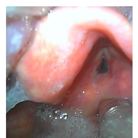
Figure 1: The rigid video laryngoscopy finding during the initial intubation attempt using 37-Fr double-lumen endotracheal tube shows an edematous epiglottis and a narrow airway due to laryngeal stenosis

A more experienced anesthesiologist was summoned for help. After discussion with the cardiothoracic surgeon, a decision was made to use a single lumen reinforced endotracheal tube (ETT). Intubation attempts were made using 7.5- mm and 6.5mminner diameter (ID) cuffed reinforced ETT (Shiely<sup>TM</sup> Lo-Contour, Covidien), however both attempts failed to pass the subglottis. Adequate mask ventilation was still possible, maintaining oxygen saturation above 96% and end tidal CO<sub>2</sub> between 30-40mmHg. While considering awakening the patient, a final intubation attempt was made using 5.0-mmID ETT. Fortunately, the ETT passed through the subglottis and entered the trachea, leading to a successful intubation. Airway peak pressure maintained below 30 mmHg throughout surgery. The surgery proceeded as planned and was completed without any complications.