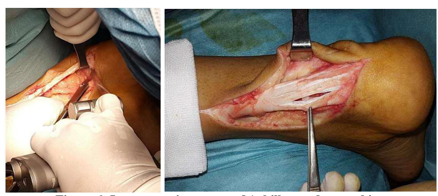
Figure 6: Intraoperative aspect of Achilles tendon combing