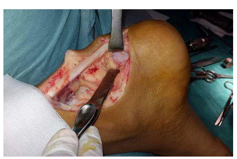
Figure 5: Intraoperative aspect of the prominence of the posterior calcaneal tuberosity