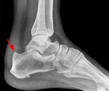
Figure 2: X-ray of the radiological aspect of the calcaneum tuberosity