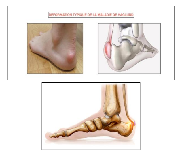
Figure 1: Clinical aspect of the calcaneum tuberosity

superior tuberosity of the calcaneus withretro-calcaneal and pre-achilles bursitis inflammation and Achilles tendinopathy. There resection of the posterosuperior tuberosity of the calcaneus performed after medical treatment allows to remove the bony protrusion source of conflict and gives good results.