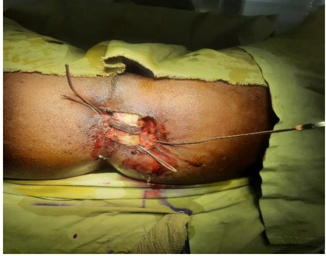
Complex fistula Tract Delineation and relation with external sphincter muscle

Farhan Imtiaz et al., Sch J Med Case Rep, Aug, 2023; 11(8): 1467-1471