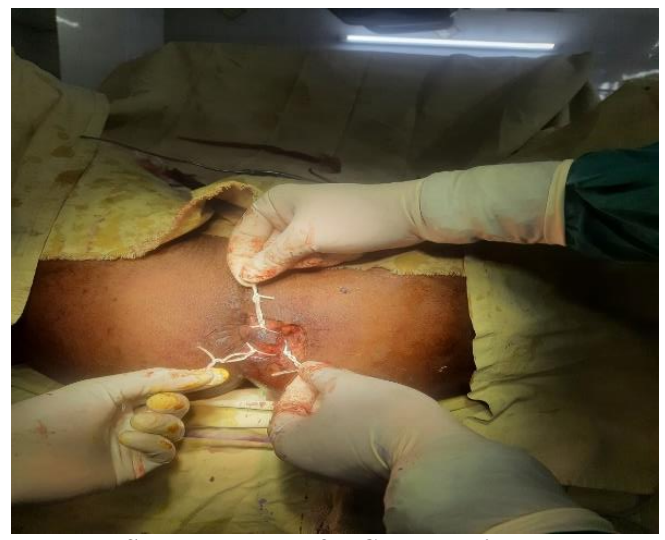
Seton placement for Complex Fistula