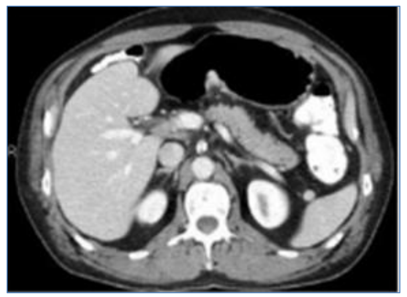
Figure 1: Axial CT scan section showing a localized thickening of the gastric wall.

multiple and deep biopsies were performed, and the histopathological examination of the resected specimens confirmed a benign gastric ulcer with no signs of malignancy, and Helicobacter pylori was not detected. A partial gastrectomy of the antre was performed. The patient remained asymptomatic at the first follow-up, one and a half years later.