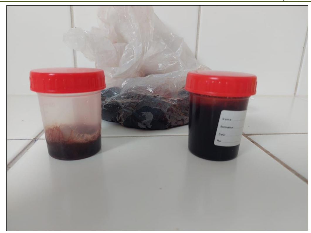
Figure 1: Large volume haemoptysis