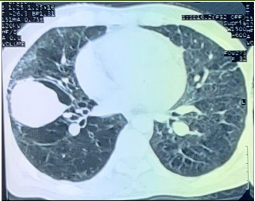
Figure 3: CTPA showing the hemorrhagic bullae