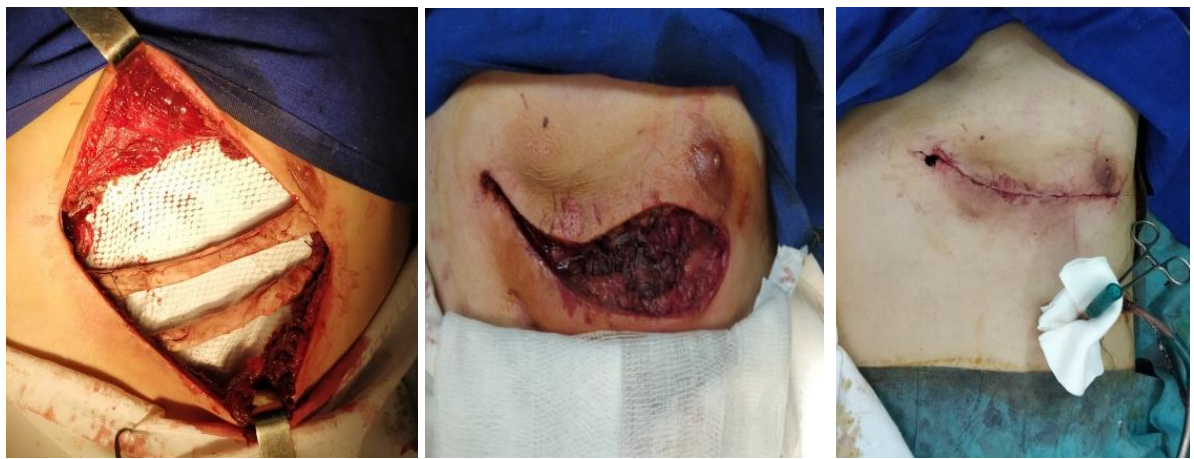
Figure 9, 10, 11: Installation of a two-sided plate and closure after plasty using the pectoralis major muscle

The pathological study of the surgical specimen confirmed the diagnosis of chondrosarcoma, the immediate and long-term evolution was favorable.