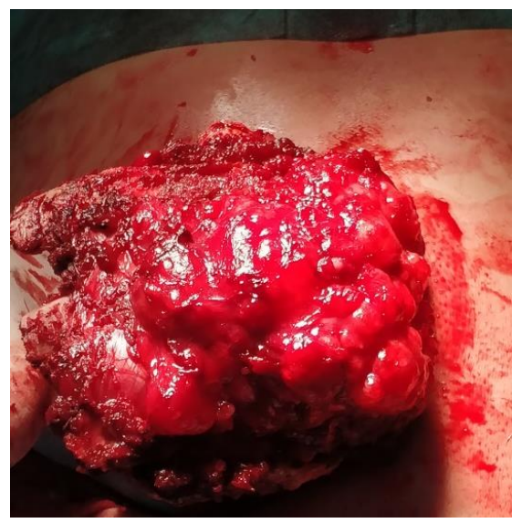
Figure 6: Excision of the tumor