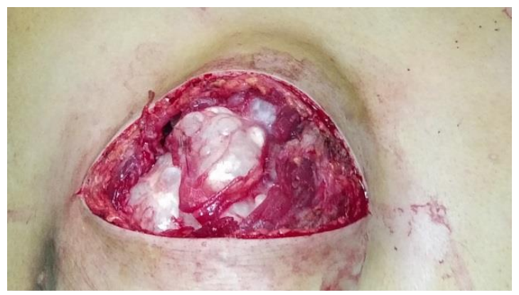
Figure 5: Incision directly above the tumor

After drainage, the skin is closed with an overlock with a compressive dressing in order to avoid peri-prosthetic collections, a source of infection (Figure 9, 10, 11).