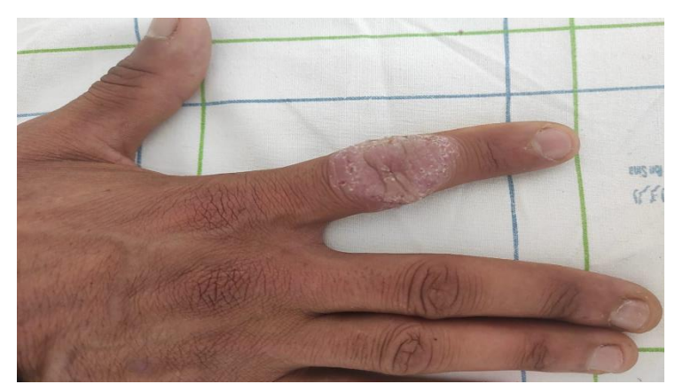
Figure 1: Isolated erythematous infiltrated plaque of the interphalangeal joint of the right index

A 30-year-old patient presented with a 3 months'history of a growing itchy plaque of the right digit. He denied any drug intake, join pain, fever, chills, sore throat or weight loss. Being a farmer as an occupation, he reported being bitten by a prickly pear during gardening activities, our dermatological examination revealed an isolated 3 cm erythematous infiltrated plaque of the interphalangeal joint of the right index, yellow crust were seen at the border of the lesion (Figure 1).