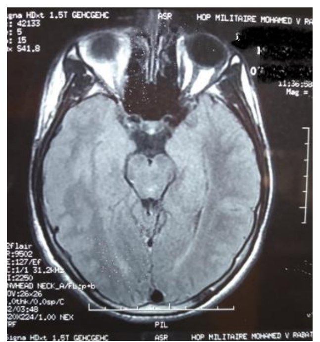
Figure 4: Mmagnetic resonance imaging showed abnormalities

After 3 days, the sedation was interrupted, the patient kept in coma. clinical examination showed laryngeal spasms and hypersialorrhea without hydrophobia led us to ask about the notion of an history of dog bite before, which the family confirmed. This accident had occurred two months before. The patient was bitten on the right foot causing a scar (Fig 5) for which he received local care with anti-rabies vaccination