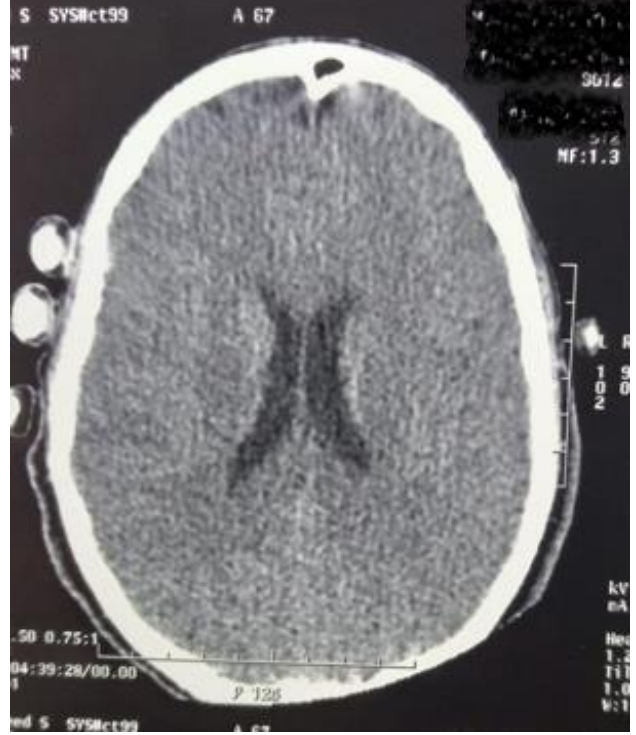
Figure 3: Cerebral computed tomography showed no abnormalities