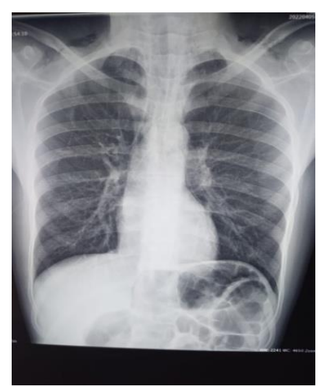
Figure 1: Pulmonary X-ray showed an interstitiel syndrome in the perihilar region without nodules or pleural effusion

were normal. A search for respiratory viruses was carried out by a multiplex PCR (herpes, VZV, influenza, RSV, etc.) And a Covid PCR was negative.