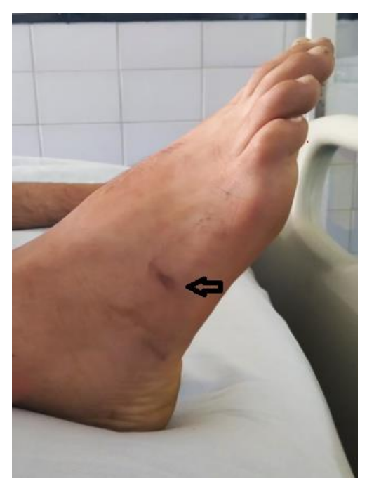
Figure 5: Scar after a stray dog bite 2 mounths ago