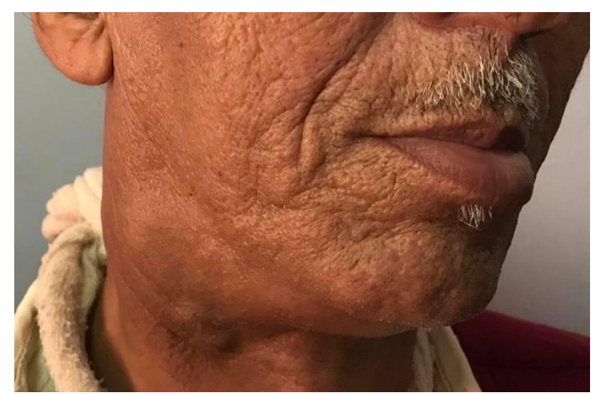
Figure 3: Regression of lymph node volume after third chemotherapy cure

This chemotherapy was followed by a combination of concomitant radiochemotherapy at a dose of 70 Gy on the tumour and its lymph node extensions, delivered at 2 Gy per fraction in 7 weeks without treatment interruption. Standard RC3D technique was used for treatment with acceptable G2 toxicity.