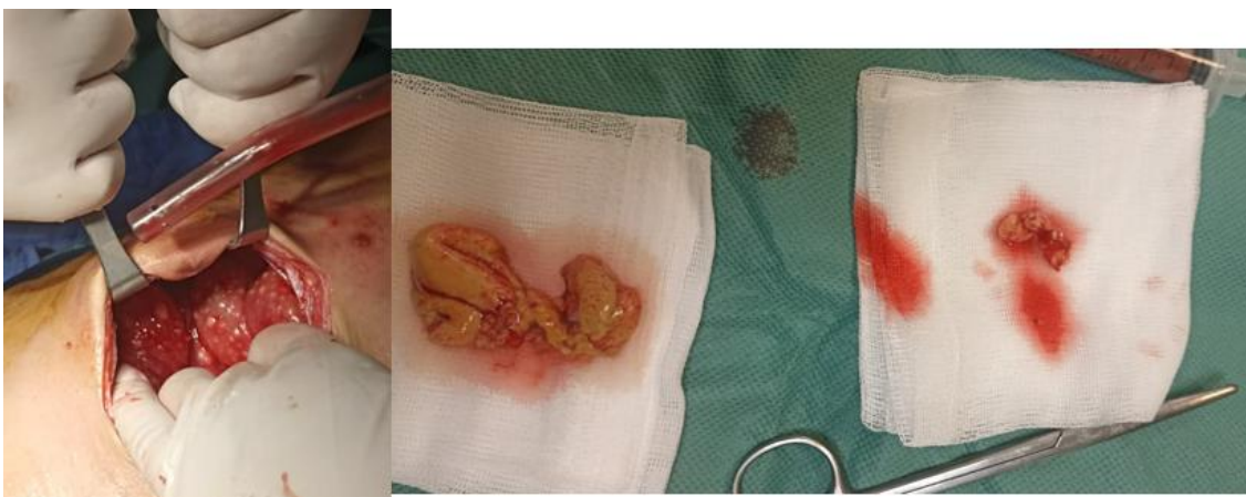
Figure 3: Exploratory laparotomy revealed widespread micronodular thickening in the peritoneum and bowel, samples of peritoneal tissues were sent for pathological examination, confirming the presence of chronic granulomatous inflammation and abscess formation consistent with miliary tuberculosis affecting both the peritoneum and intestines