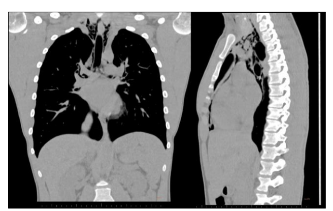
Fig. 2 second episode: Chest CT: diffuse pneumomediastinum extending to the fatty planes of the cervical region (subcutaneous emphysema)

© 2024 Scholars Journal of Medical Case Reports | Published by SAS Publishers, India