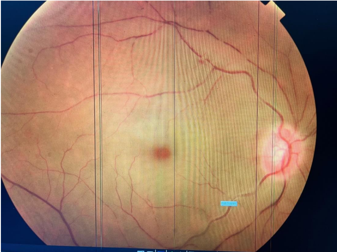
Figure 1: Retinophotography of the right eye with visible emboli on the arterial tracts, red macula, stage 1 papilledema

The hypertensive peak was urgently controlled with intravenous Nicardipine (Loxen).