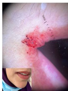
Figure 4 : Asymptomatic, erythematous papule located on the oral commissure of a 33-year-old woman. The dermoscopic view shows a pattern composed of red lacunae with hypopyon sign, white lines and vascular structures.