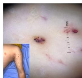
Figure 5 : lymphangioma circumscriptum located on the arm of a 10-year-old child shows only dark lacunae, mimicking a solitary angiokeratoma.