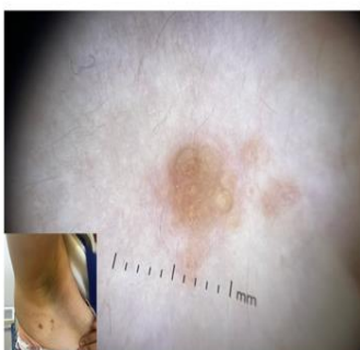
Figure 2 : lymphangiomas circumscriptum located on the axilla of a 28-year-old woman. . Dermoscopically, we see yellow lacunae, white lines and vascular structures