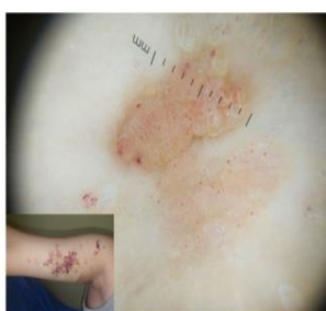
Figure 3 : Lymphangioma circumscriptum located on the arm of a 6-year-old child. The dermoscopic view shows a multicoloured lacunae red , and yellowish incipient white line, vascular structures and a yellowish background.