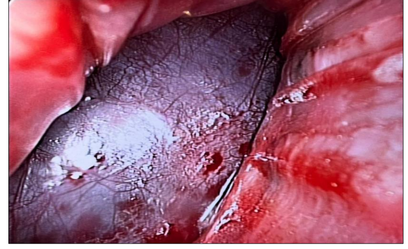
Figure 3: 1: A Video Assisted Thoracoscopic Surgery (VATS) image of the pericardial cyst prior to excision.