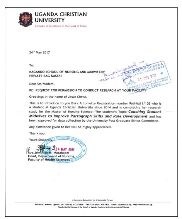
Appendix B: Introductory Letter II