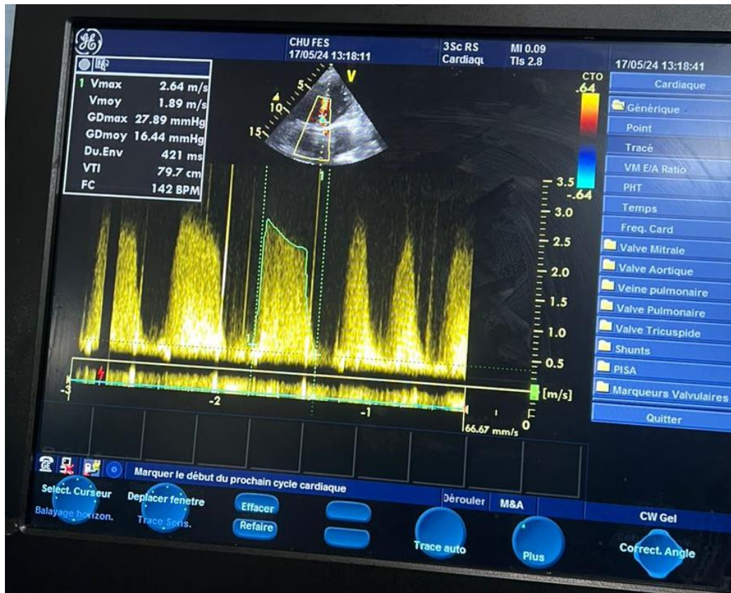
Figure 1: Transthoracic Echocardiography on Admission

rate of 140 bpm. Blood pressure was stable, and pulmonary auscultation revealed bilateral crackles. She was admitted to the maternal intensive care unit, placed in a semi-sitting position, and started on oxygen therapy. Transthoracic echocardiography revealed a high trans-mitral gradient (maximum 27.89 mmHg, mean 16.44 mmHg), increased peak velocity (2.64 m/s), good left ventricular function, and a dilated left atrium (Figure 1). A transoesophageal echocardiogram confirmed the diagnosis of mechanical mitral valve thrombosis.