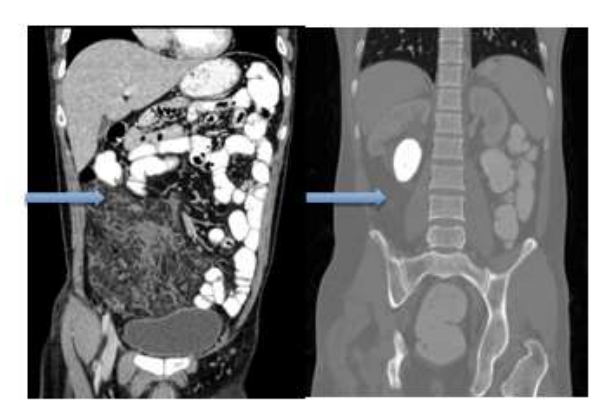
Fig. 1a & 1b: CECT Abdomen Coronal Sections showing (a) large ill-defined fatty mass in right side of abdomen and pelvis displacing the adjacent bowel loops. (Extensive fat stranding in large area of Omentum) (b) Large oval shaped 5 cm calculus in right kidney within its extra renal pelvis with no hydronephrosis

USG revealed a large calculus in right kidney in renal pelvis with no hydronephrosis and an illdefined heterogeneous echogenic mass in right iliac fossa likely to be appendicular phlegmon.