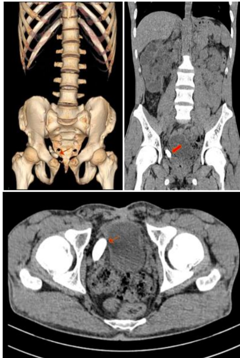
Figure 1: CT scan showing a large distal ureteral stone [red arrow] at the iliac segment with upstream right pyelocaliceal dilatation

measuring 30 \times 13 mm with an estimated density of 1200 Hounsfield units [Figure1].