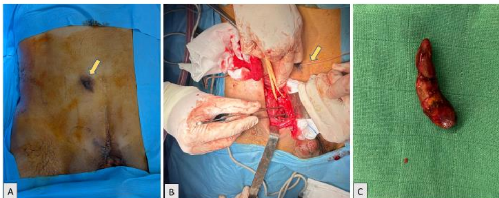
Figure 2: Definitive surgical management through a right iliac approach. [A] Right iliac incision; the yellow arrow indicates the Mitrofanoff channel. [B] Intraoperative dissection and exposure of the pelvic ureter. [C] Distal ureteral stone after extraction

layer-by-layer through the musculoaponeurotic planes to the pelvic retroperitoneum. The iliac vessels were identified. The vas deferens was recognized and ligated to facilitate exposure. The pelvic ureter was exposed and dissected to its terminal portion [figure2-B]. The stone was localized by palpation and extracted through ureterotomy using an appropriate forceps [figure 2-C]. Attempted placement of a double-J stent failed due to severe stenosis of the terminal ureter at its vesical implantation site. The ureter was transected proximal to the stenotic segment, and a double-J stent was placed [figure2-B].