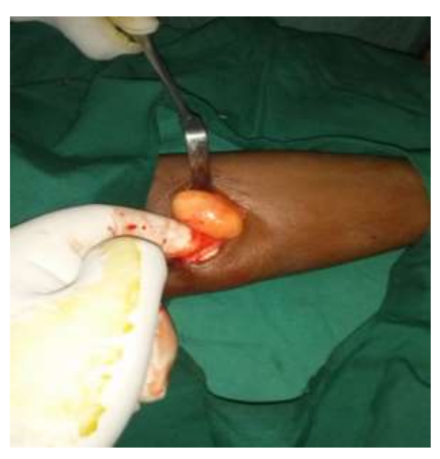
Fig-2: The nerve was found to run through the lipoma and was pressed against the distal border of the supinator muscle