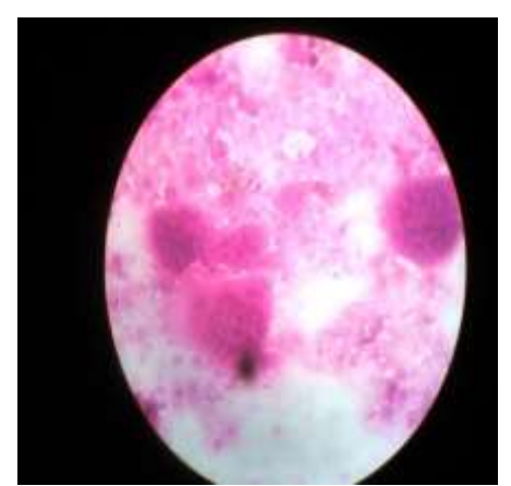
Fig. 3: Haematoxylin and Eosin stained FNAC smear showing diffuse distribution of giant cells in a