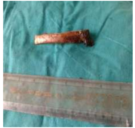
Fig. 1: Gross picture of part of tenth rib with an attached irregular and brownish mass at one end

activity was identified. Chondroid or osseous elements were also absent. Both the surgical margins of excision were free of tumour. On strict follow up the patient remained well without evidence of recurrence after two years of surgery.