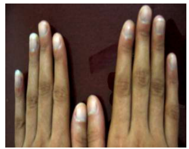
Fig. 1: Clubbing and cyanosis

This case has been reported as the rare complex congenital heart disease went undetected till 18 years age and presented as Infective endocarditis, without any invasive procedure.