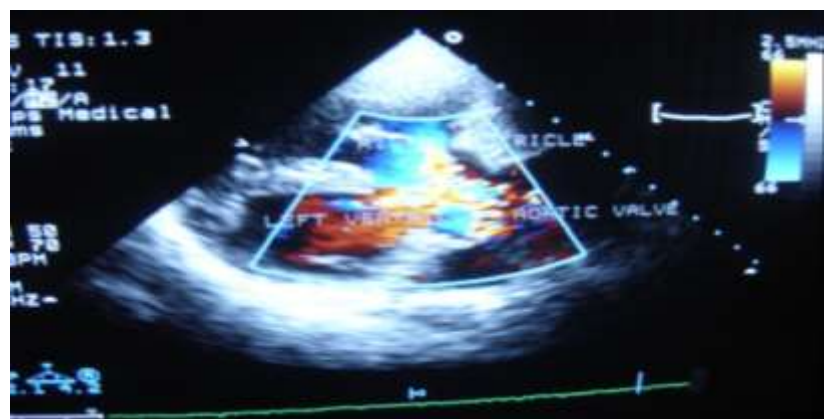
Fig. 4: Transthoracic 2D and Doppler echocardiography revealed large VSD,with pulmonary atresia with large Major Aortopulmonary Collateral Arteries (MAPCA) and vegetations seen on aortic valve