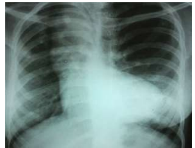
Fig. 2: Chest X-ray showing –Rt sided Aortic arch and boot shaped heart with pulmonary blood flow