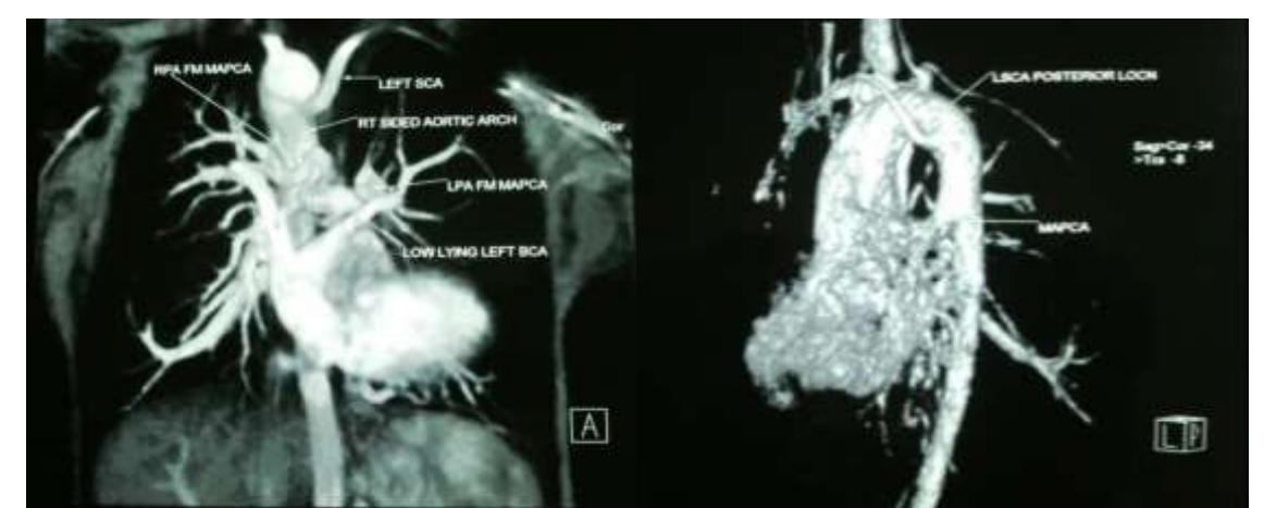
Fig. 5 & 6: Cardiac MRI- showing TOF features- with Sub-aortic VSD and RVH with Right sided Aortic Arch with PDA and Multiple large MAPCA's. Also there was Atresia of Main pulmonary artery (MPA) with reformation of Right Pulmonary Artery & Left Pulmonary Artery from MAPCA's.

Fig. 4: Transthoracic 2D and Doppler echocardiography revealed large VSD,with pulmonary atresia with large Major Aortopulmonary Collateral Arteries (MAPCA) and vegetations seen on aortic valve