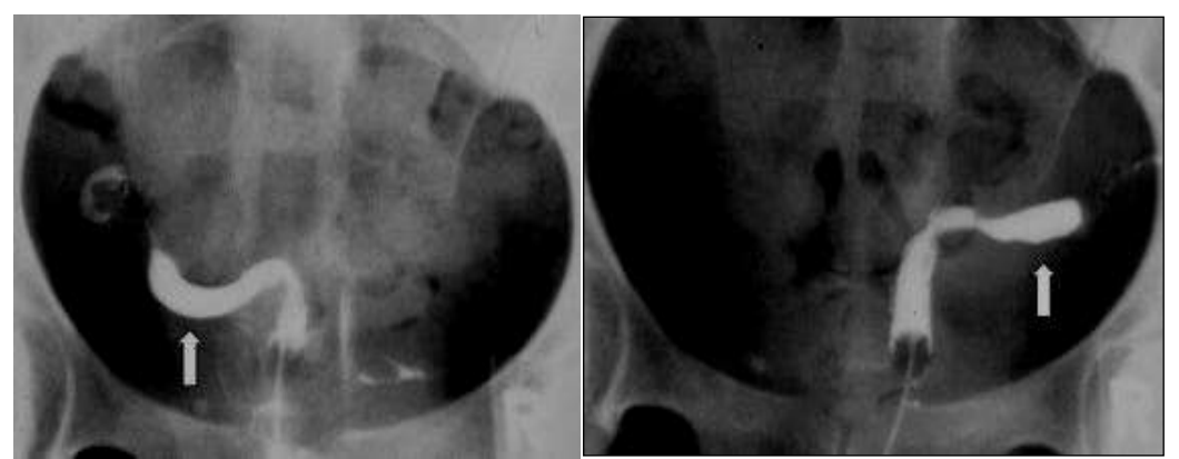
Fig. 3: HSG images shows double uterus, double vagina