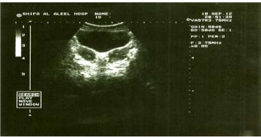
Fig. 1: Transverse U/S image shows double uterus