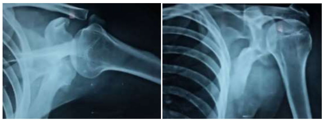
Fig. 1: X ray left shoulder

There was not any case reported earlier with such a defect. We concluded that the traumatic defect in the scapula is an unusual presentation and can be treated conservatively without any complications.