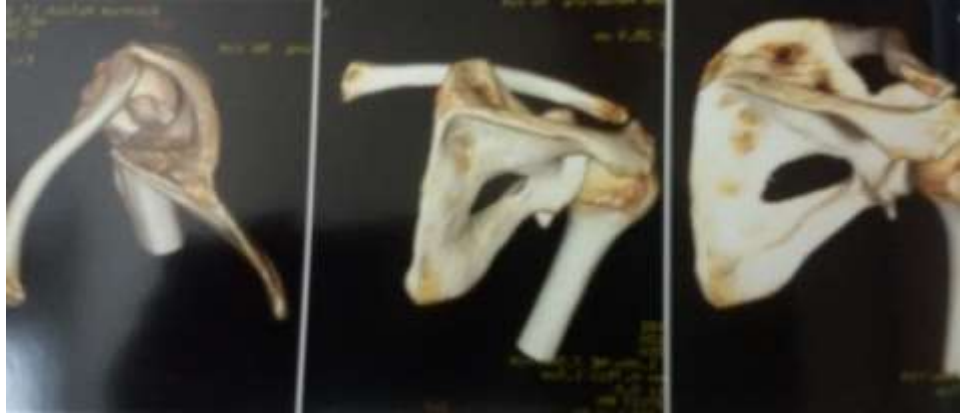
Fig. 3: 3D CT Left Scapula