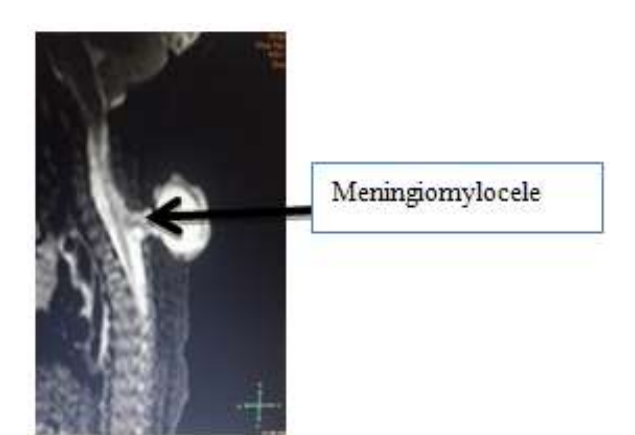
Fig. 2: Sagittal MRI (FLAIR) cervical spine shows meningiomylocele