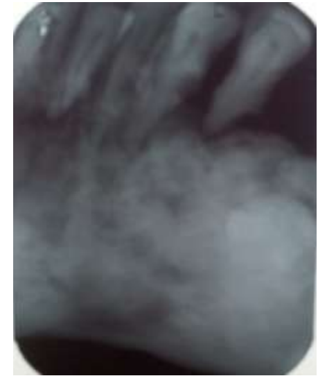
Fig. 4a: IOPA of lower left anterior region showing radio-opaque region suggested of osseous dysplasia

A bony prominence was felt on posterior lingual aspect of mandible with respect to 36, 37 region. On the basis of clinical examination provisional diagnosis of Osteomyelitis with extraoral draining sinus with respect to 36 was given. A written informed consent was obtained and the patient was referred for routine radiographic and hematological examination. IOPA of left mandibular edentulous area (Fig. 4a & 4b) showed radiopaque area (sequestrum) surrounded by a radiolucent area suggestive of Osteomyelitis.