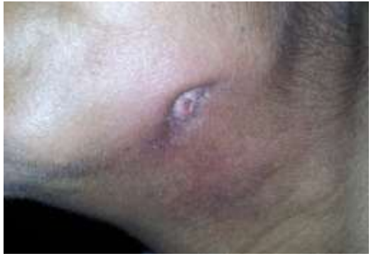
Fig. 2: Lateral view of left mandible showing draining sinus at lower border of mandible

Draining sinus was seen on the lower border of mandible (Fig. 2) with tender and enlarged Left submandibular lymph nodes. A well defined bony hard swelling felt at left lower border of mandible. Intraoral examination revealed that 35, 36 were missing (Fig. 3) with mild pain on palpation & buccal cortical plate expansion was noticed in 35, 36 region.