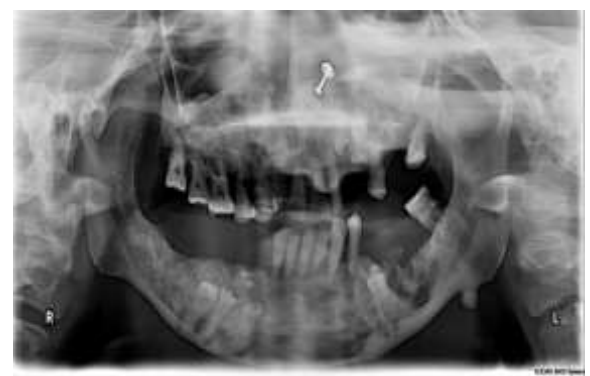
Fig. 5: Orthopantomograph showing radio-opaque lesion in all four quadrants suggestive of florid osseous dysplasia with multiple impacted teeth and osteoma at left lower border of mandible

OPG (Fig. 5) revealed cotton wool appearance suggestive florid osseous dysplasia, multiple impacted teeth (supernumerary) and osteoma on left lower border of mandible.