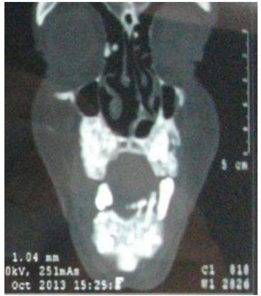
Fig. 6: ct scan section showing radiodence lesion in all four quadrants suggestive of bone dysplasia

CT scan (axial section) suggestive of osseous dysplasia (Fig. 6) and 3D CT image (Fig. 7) suggestive of osteoma at forehead and left lower posterior border of mandible.