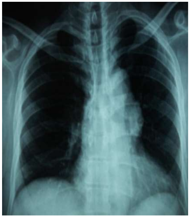
Figure 1: Chest X-ray: opacity of waterborne tone left hilum polycyclic contours.