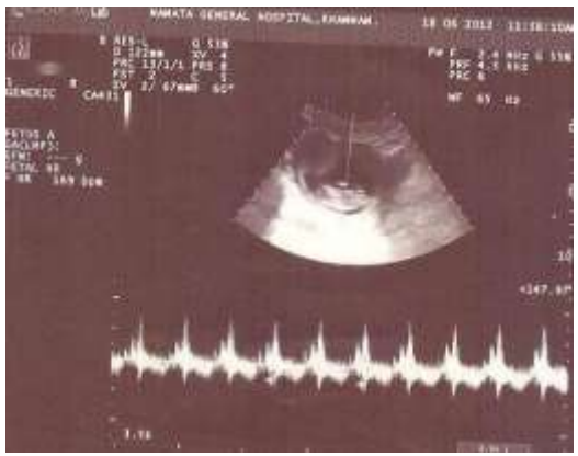
Fig. 3: Post-operative TVS- viable pregnancy