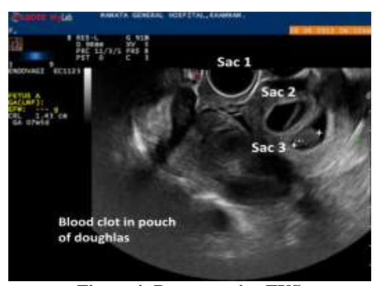
Figure 4: Pre-operative TVS

25 year old, primigravida with 8weeks of gestation presented with giddiness, abdominal pain and hypovolemic shock. She was investigated for primary infertility of 6 years and diagnosed as PCOD. Laparoscopic ovarian drilling was done. Semen analysis showed oligospermia. She conceived with clomiphene citrate, HCG and IUI. USG showed triplet intrauterine pregnancy with ectopic gestation in left fallopian tube (Fig. 4). USG guided ectopic ablation was done with KCL but no follow up. Intraoperative findings were uterus 8 weeks size, cystic mass of 3×3.5cm in ampulla of left tube with hemoperitoneum (Fig. 5). Left salpingectomy was done. Post operative USG showed one live fetus in uterine cavity of 8 weeks, second sac empty and third sac with fetal pole, without cardiac activity (Fig. 6). Pregnancy continued. At 16 weeks, USG showed single live intrauterine pregnancy with disappearance of other two sacs. At 24 weeks severe oligohydramnios was detected (AFI=2cm). Patient refused admission. Later she came with IUD at 26weeks.