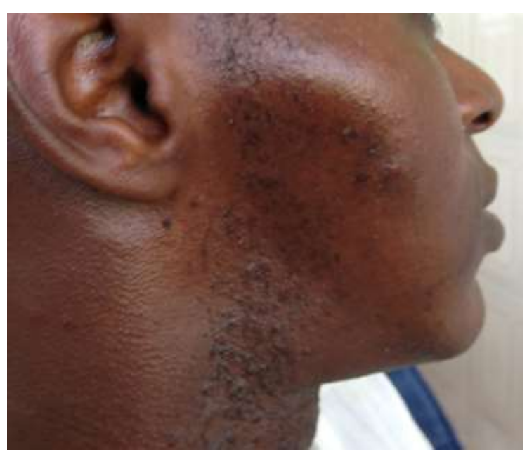
Fig. 4: Photograph of patient showing loss of bone support in the mandibular ramus and angle region (R)