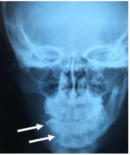
Fig. 2: Digital Skull Xray of patient (Posterior-Anterior view) showing further loss of bone in mandibular body (R)