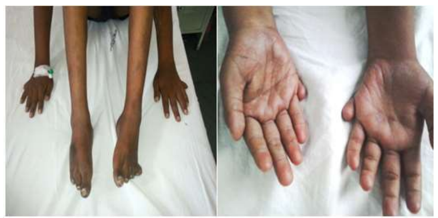
Fig. 1: postaxial polydactyly with hexadactyly of hands and feet