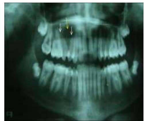
Fig. 5: OPG of a 9 year old female patient reveals a radiolucent lesion with diffuse margins & displacement of maxillary premolars roots

Axial and reconstructed computed tomography scan (Fig. 6 & 7) showed a well defined large multilocular expansile radiolucent lesion with erosion, cortical destruction and thinning of buccal cortex.