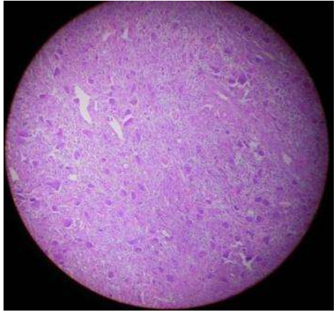
Fig. 8a: Photomicrograph showing giant cell...CGCG (H & E, X10)

The radiographic differential diagnosis was given as Ameloblastoma , aneurysmal bone cyst and hemangioma. Incisional biopsy (Fig. 8a & 8b) was taken for confirmation of diagnosis and management of lesion, which shows features of CGCG.