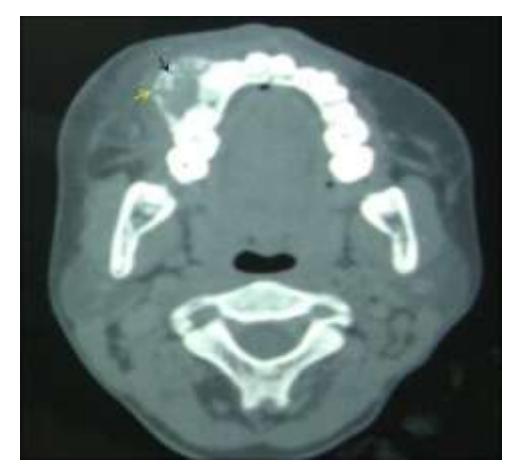
Fig. 6: Axial CT scan of a 9 year old female patient reveals a well defined multilocular lesion with thinning and perforation of buccal cortex

Axial and reconstructed computed tomography scan (Fig. 6 & 7) showed a well defined large multilocular expansile radiolucent lesion with erosion, cortical destruction and thinning of buccal cortex.