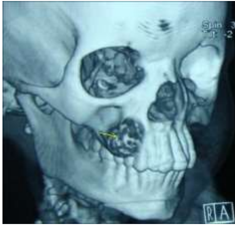
Fig. 7: Reconstructive 3D image of a 9 year old female patient reveals topographic view of lesion with buccal cortex expansion and perforation