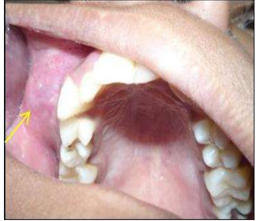
Fig. 2: Intra oral view of a 9 year old female patient showing a well defined palpable swelling in maxillary premolar region

Intraoral (Fig. 3 & 4) and panoramic (Fig. 5) radiographs revealed a well defined radiolucent multilocular lesion having thin septa in premolar region with displacement of premolar roots.