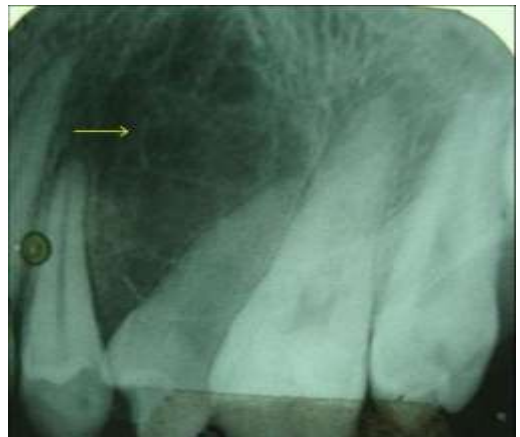
Fig. 3: IOPA radiograph of 9 year old female patient shows multilocular radiolucent lesion with displacement of premolar root

Intraoral (Fig. 3 & 4) and panoramic (Fig. 5) radiographs revealed a well defined radiolucent multilocular lesion having thin septa in premolar region with displacement of premolar roots.