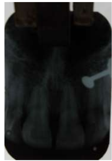
Fig-2: Radiographic appearance