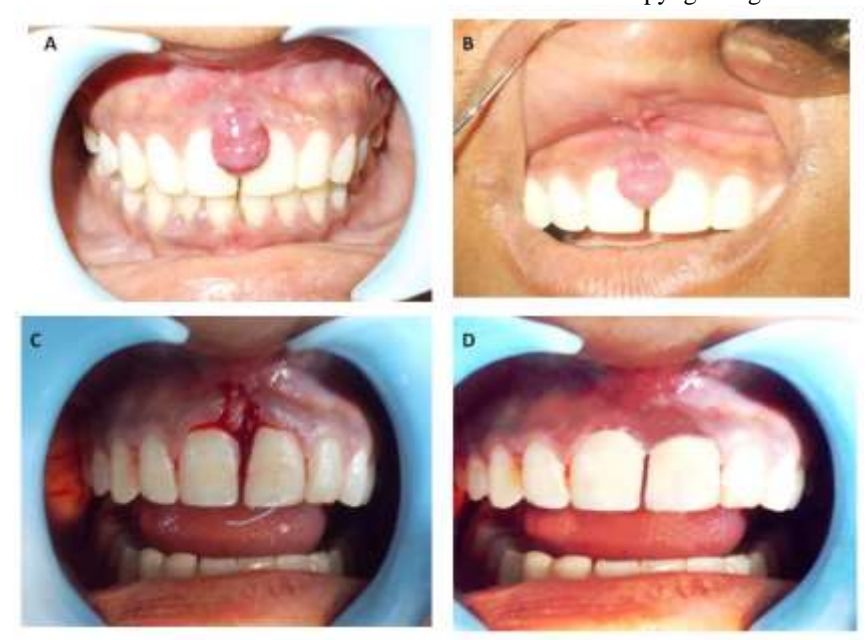
Fig- 1: A) Pre-operative B) Decrease in size of lesion after Diode Laser therapy C) Post surgical excision D) After 1 month

Histopathological examination of the growth revealed Stratified squamous orthokeratinized epithelium covering cellular connective tissue. The epithelium shows area of ulceration below which can be seen inflammation in the connective tissue. the connective tissue shows proliferating fibroblasts and collagen fibres interposed in which can be seen lot of epithelial lined spaces within the connective tissue can be seen patchy distribution of lymphocytes and plasma cells. There was no evidence of atypia or malignancy. The clinical and histopathological findings confirmed it to be a case of pyogenic granuloma. (Figure 3)