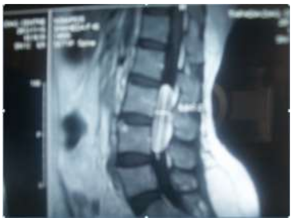
Fig-1: MRI lumbosacral spine sagital section shows isointenseintradural lesion at L3 level.

areas. Microscopic examination of the hematoxylin – eosin staining revealed tumour cells arranged in zellballen pattern (fig 2). The individual cells had moderately abundant cytoplasm and centrally placed round to oval nuclei with salt and pepper type of chromatin. There were no mitotic figures. There was no necrosis so diagnosis of neuroendocrine tumour was made on immunohistochemistry tumour cells were positive for chromogranin, synaptophycin, and interspersed cells were positive for s-100(fig 3). With these features the diagnosis of paraganglioma was confirmed. The patient underwent post operative radiotherapy and the patient is on follow up.