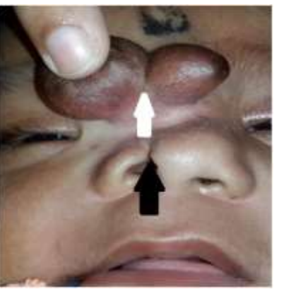
Fig. 2: White arrow shows junction of normal and telengiectatic hairy skin and Black arrow pointing the cleft nose

Fig. 1: Extranasal swelling at the root of nose (right Paramedian) with right nasal cleft