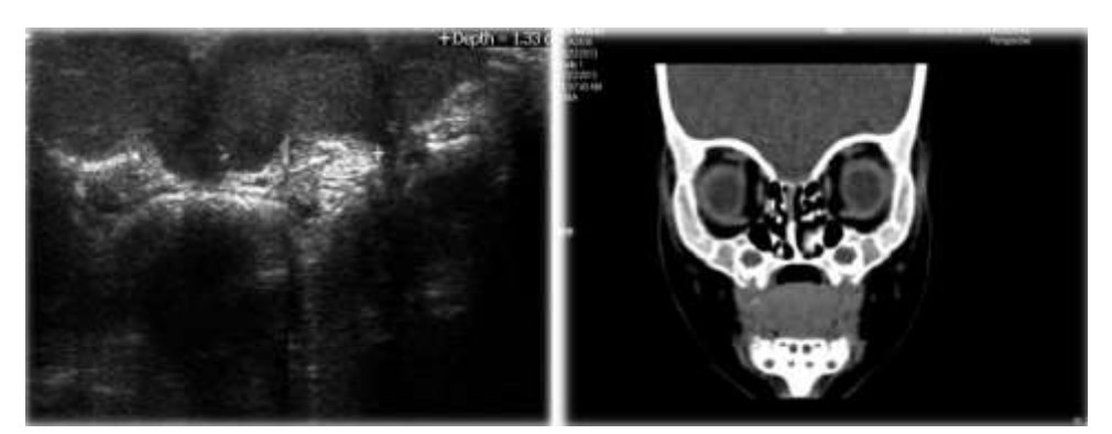
Fig. 3: USG on left showing well defined iso to hypoechoic subcutanoeus mass with homogenous echotexture and axial CT on right showing a large well defined isodense subcutaneous polypoidal mass