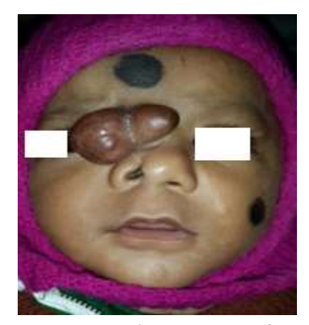
Fig. 1: Extranasal swelling at the root of nose (right Paramedian) with right nasal cleft

Also seen were numerous neurons with some showing axonal projections. The diagnosis of nasal glioma was hence established. Sutures were removed on seventh day. Cleft nose correction was contemplated at a later stage and the same was conveyed to the parents and were advised for a regular follow up. However they failed to show up.