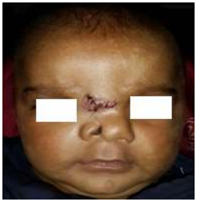
Fig. 6: Post-Op day 3. Note the more evident telecanthus and broad nose after removal of nasal glioma