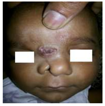
Fig. 7: Post-Op day 7. After suture removal. Oedema and erythema noted.

Fig. 6: Post-Op day 3. Note the more evident telecanthus and broad nose after removal of nasal glioma