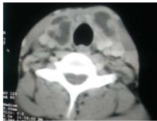
Fig. 3: Contrast enhanced CT image showing hypodense lesion with internal septations and peripheral enhancement within thyroid gland