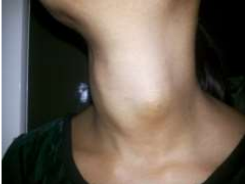
Fig. 1: Image showing neck swelling in 22 year old female

or hyperthyroidism. She had no complains of dysphagia, weight loss or hemoptysis. There was no history of tuberculosis. On examination, swelling was seen in infrahyoid region which was more on left side, deglutition. In laboratory moving with tests. hemoglobin level was 12 g/dL and ESR 24mm/hr. The thyroid function tests was as follows: T3 169 ng/dL ; T4 10 ug/dL ; thyroid- stimulating hormone (TSH) 2.16 uIU/mL. The patient was non-reactive for HIV. High resolution ultrasound revealed multi-septated collection involving left lobe, isthmus and part of right lobe of thyroid with few necrotic lymph nodes. Abdominal ultrasound was normal. On CT imaging, there was a hypo dense lesion with peripheral enhancement involving thyroid gland with few lymph nodes. Contrast enhanced CT thorax was normal. Patient underwent ultrasound guided FNAC which revealed acid-fast bacilli on Ziehl- Neelsen staining. After that, the patient was started on anti-tubercular therapy.