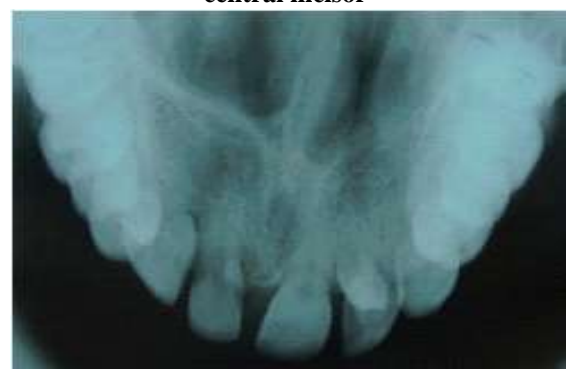
Fig. 6: Occlusal radiograph showing the position of mesiodens and congenitally missing right central incisor