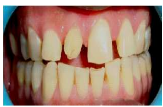
Fig. 9: Introral appearance of mesiodens

A 30 year old male patient was refined to the department of Oral medicine and radiology with a complaint of spacing between upper front teeth. On intraoral examination one mesiodens was found in maxillary anterior teeth region with missing right central incisor and anterior spacing (Fig. 9). Radiographic examination revealed one molariform mesiodens with congenitally missing right central incisor (Fig. 10).