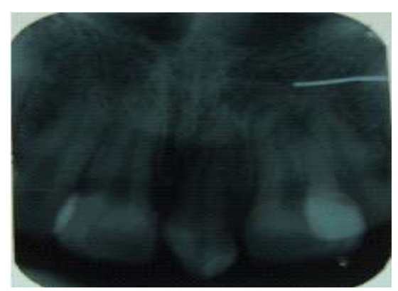
Fig. 8: Periapical radiograph showing molariform mesiodens