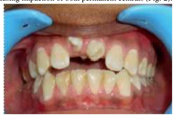
Fig. 1: Two mesiodens with multiple lobes

on occlusal surface, well demarcated on the radiograph causing impaction of both permanent centrals (Fig. 2).