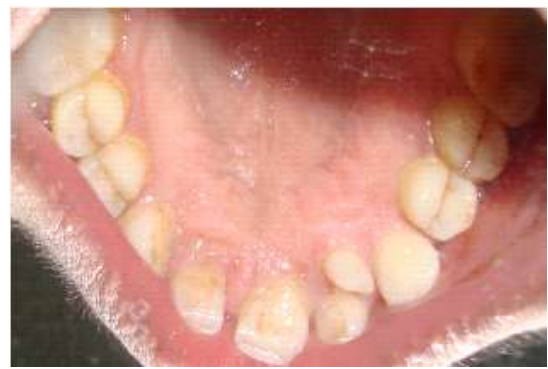
Fig. 5: Introral appearance of molariform mesiodens palatally to left lateral incisor with missing right central incisor

A 32 year old female reported with spacing in upper front teeth region. She was concerned about the unesthetic appearance. Clinical examination revealed that the patient had one extra tooth palatal to left lateral incisor with multiple cusps resulting in spacing of the maxillary anteriors as well as rotation of left lateral incisor and missing right central incisor (Fig. 5). Soft tissue was normal, there was no relevant medical and family history and the patient was otherwise healthy and not associated with any syndrome. Occlusal radiographic was carried out to evaluate the condition of mesiodens. Radiograph revealed molariform mesiodens with completely formed root congenitally missing 11 (Fig. 6).