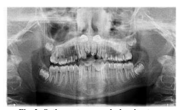
Fig. 2: Orthopantomograph showing two molariform mesiodens and impacted centrals