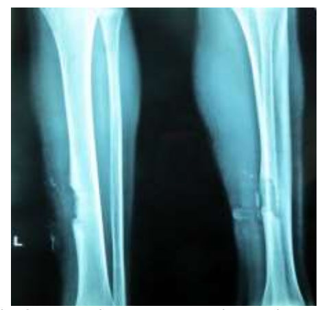
Fig. 3: Immediate post-operative radiograph showing cortical trough

The patient was planned for surgical management in view of refractory trial of conservative treatment that included rest, pain medications, empirical broad spectrum antibiotic along with supportive, symptomatic management for two months. The surgery was done after proper written informed consent by parents in view of the case being minor. The tibia was accessed through antero-lateral approach with incision as per our requirement. A longitudinal cortical trough over the affected segment of the bone was fashioned using multiple drill-hole technique. A cortical deroofing in this way was followed by localized intramedullary curettage. The sclerosed and abnormal bony tissue was removed from cavity till the endosteal bleeding was apparent and obstructed medullary cavity was recanalised with drilling on either side till healthy marrow from normal bone oozed out (Fig. 3). The curetted matter along with part of marginal healthy bone prepared for investigations. There was no facility of intra-operative frozen section by experienced pathologist to ascertain the limit of healthy and abnormal part of the bone, so we relied on clinical and gross macroscopic evaluation at the time of surgery.