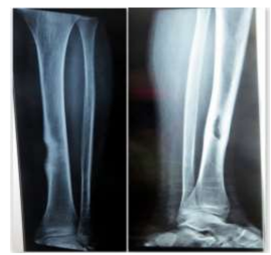
Fig. 4: Three month post operative radiograph showing healing bone defect

There was dramatic improvement in all clinical parameters including pain profile. Over a period of two weeks postoperatively, the pain gradually decreased to a state of no pain and the child resumed weight bearing to tolerance. The child was asymptomatic since 2 months postoperatively. The surgical wound healing was uneventful and there was no subsequent morbidity with respect to the cortical trough site during follow up till one year. The cortical defect gradually filled with normal bone in serial radiographic studies (Fig. 4). The child was asked to remain in periodic review in view of any complication or recurrence of the lesion.