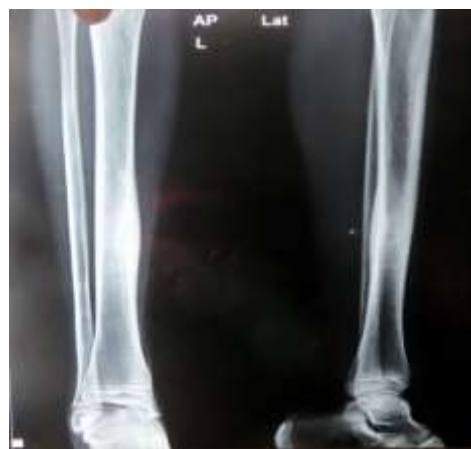
Fig. 1: Radiograph showing thickened, sclerosed and fusiform segment of affected bone