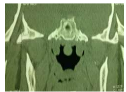
Fig-4: CT scan showing cyst like lesion

A 28 year male patient presented to us with only nasal obstruction and post nasal drip. Routine ENT examination was normal. Nasal endoscopy showed smooth swelling which was later on was confirmed as thornwaldt's cyst on CT scan. Patient was taken up for marsupialisation of cyst under general anaesthesia. Post operative period was uneventful.