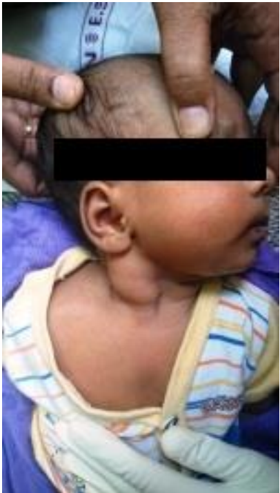
Fig-1: One month old baby boy with right lateral cervical mass