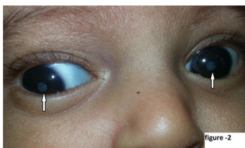
Fig-2: Clinical photograph showing bilateral nuclear cataract (as shown with arrows).